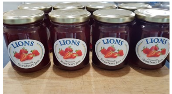
Lions Homemade Jams