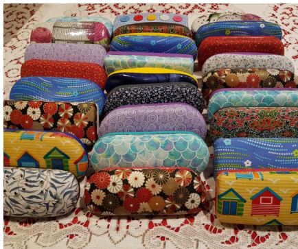
Upcycled spectacle cases